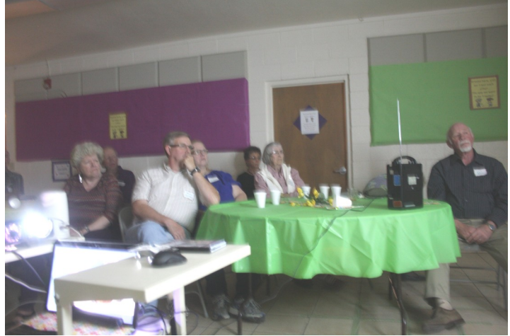
In-Betweeners watching video

The dinner was the usual well supplied pot-luck. The video was shown in Watkins Hall because there were too many people to seat all of them in the theater in Reeves Hall.